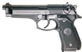
FS 92 Beretta