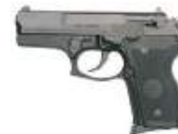
Stoeger Cougar 8000